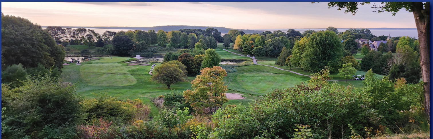
Jewell Golf Course on Mackinac Island.