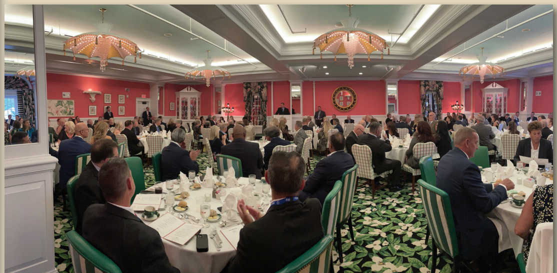
FBINAA Fall Training Conference Thursday night dinner.