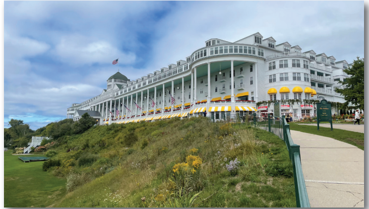
The Grand Hotel on Mackinac Island.

We are proud that the conference was fully booked this year with 130 attendees and the addition of 70 spouses and 18 vendors. It was a great turnout with N.A. graduates ranging from the 132nd Session to the most current 286th Session!